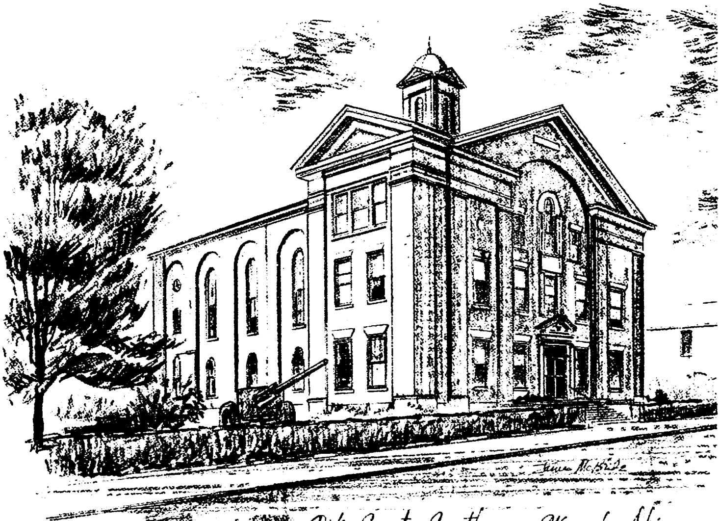
Pike County Courthouse Waverly, Ohio