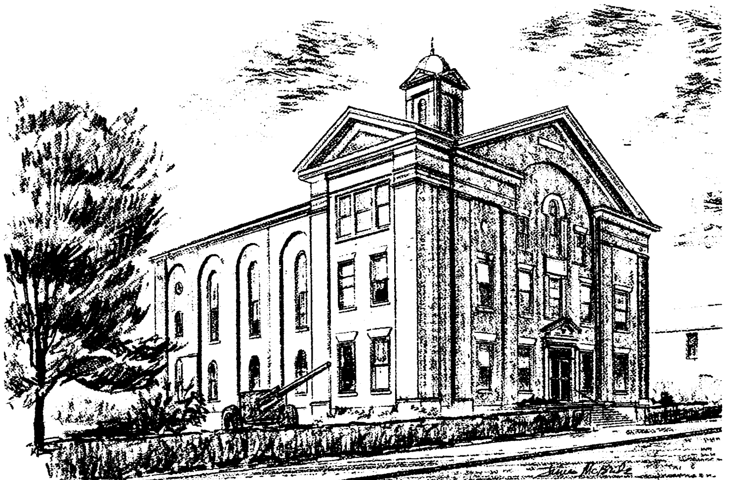
Pike County Courthouse Waverly, Ohio