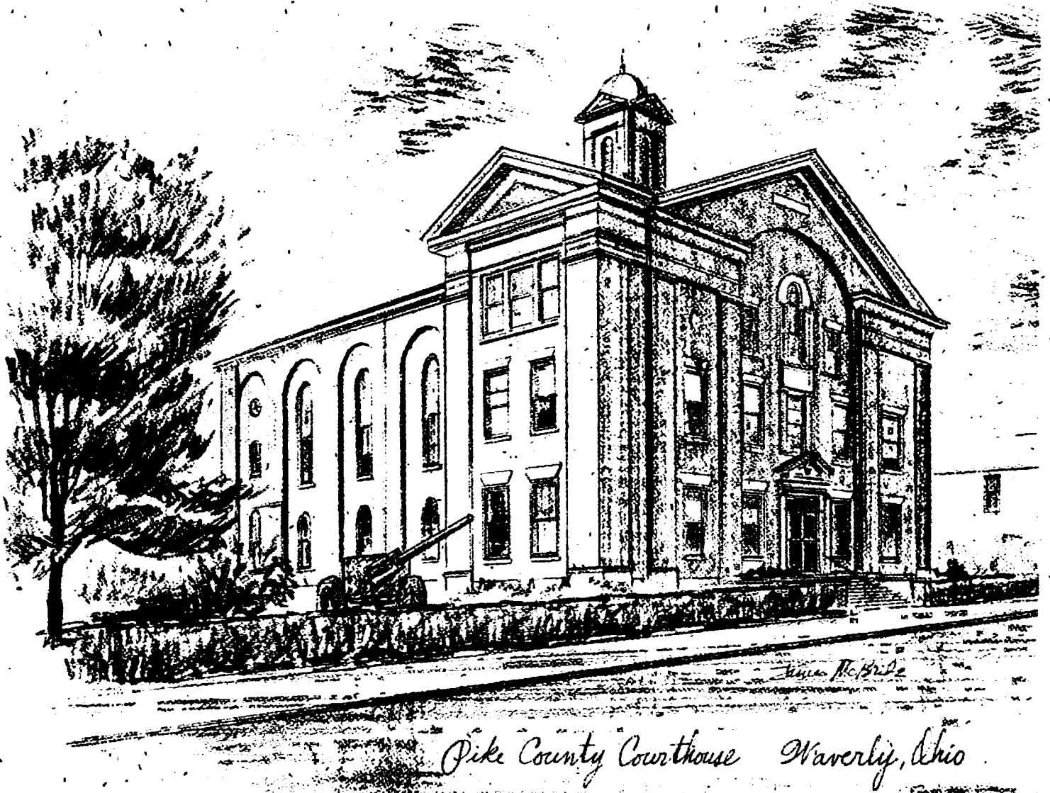
Pike County Courthouse Waverly, Ohio