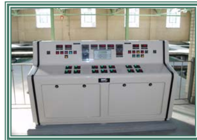
New Filter Console

The project will optimize filter performance and provide MVSD operators the ability to fulfill the intent of the Interim Enhanced Surface Water Treatment Rule (IESWTR) while providing a potable and reliable water service.