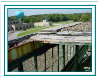
Condition of the roof prior to construction

The Head House Building is a historic structure built in the early 1930's. The Head House Roof Improvement Project involved the replacement of various roof level sections, skylights, clerestories and appurtenances, roof drains and downspout system and roof access improvements to the building that houses the chemical feed systems and water treatment processes (rapid mix, flocculation and settling).