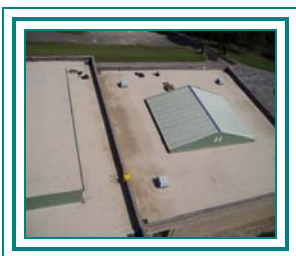
Head House Roof after construction